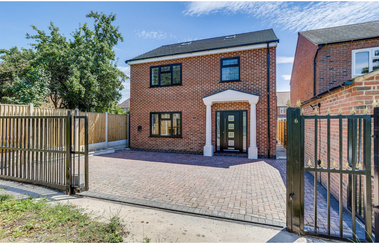
Old Bar Close, Basford, Nottinghamshire NG6 0RE